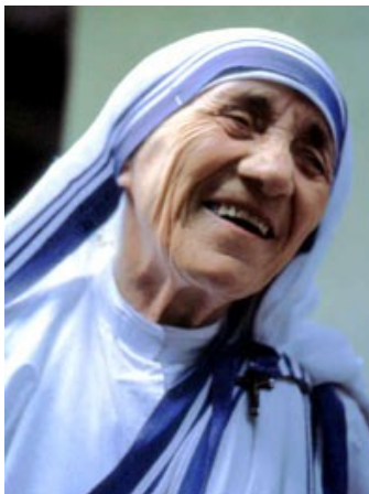
Mother Teresa of Calcutta

Mother Teresa graced the cover of Time Magazine the week of September 1 st , 2007. It read: The Secret Life of Mother Teresa. Newly published letters reveal a beloved icon's 50 year crisis of faith. I eagerly read the article several times and used it as the starting point of my homily that weekend.